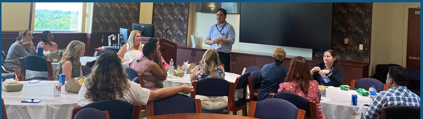
Boxed lunch with Ph.D. students, faculty, & staff in the Chancellor's Dining Room, Terry Administration Bldg. 5th floor.

from three different programs: Physical Therapy Program (3-Ph.D. students), Speech-Language Pathology Program (7-Doctoral students), & Occupational Therapy Program (7-Ph.D. students). The students had intensive four-full days of Quantitative & Qualitative Research Design content. However, on Friday, June 23rd our students were able to enjoy a boxed lunch with our occupational therapy faculty and staff members (pictured below). During the lunch, students were able to share their current dissertation concepts, current practice/academic area(s), and where they see themselves 5 years after they graduate with their Ph.D. Faculty members shared their current roles and responsibilities in the OT Department as well as a recent project(s) they are working on with OT students.