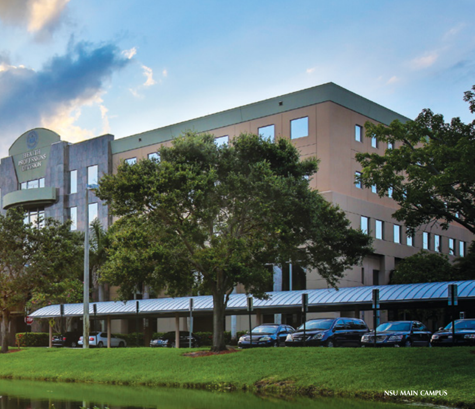
NSU MAIN CAMPUS

166,000 alumni and current enrollment of more than 24,000 students . Fully accredited by the Commission on Colleges of the Southern Association of Colleges and Schools, the university awards associate's, bachelor's, master's, educational specialist, and doctoral degrees in a wide range of fields including the health professions, law, business, marine sciences, psychology, social sciences, computer and information sciences, and education.