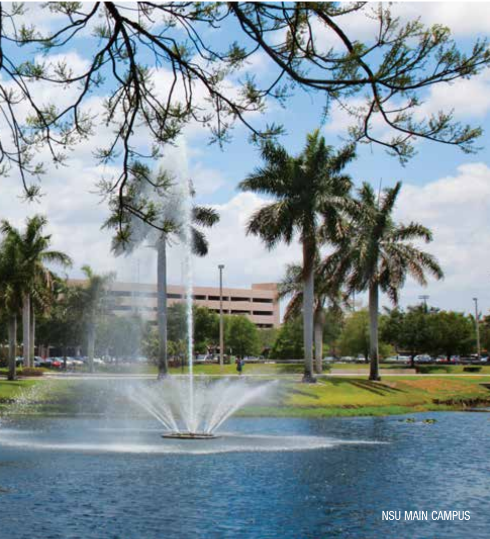
NSU MAIN CAMPUS

Founded in 1964 as Nova University, the institution merged with Southeastern University of the Health Sciences in 1994, creating Nova Southeastern University. To date, the institution has more than 143,000 alumni . Fully accredited by the Commission on Colleges of the Southern Association of Colleges and Schools, the university awards associate's, bachelor's, master's, educational specialist, and doctoral degrees in a wide range of fields including the health professions, law, business, marine sciences, psychology, social sciences, computer and information sciences, and education.