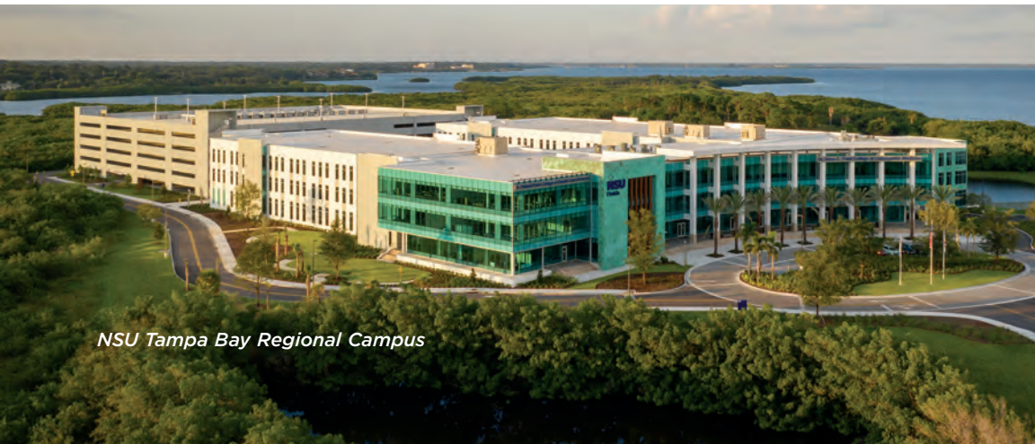
NSU Tampa Bay Regional Campus

NSU's Health Professions Division (HPD), with a student body of more than 8,000, is home to eight colleges. Located on the Fort Lauderdale/Davie Campus, it occupies a $70-million complex, covering 21 acres. HPD includes eight buildings totaling more than 900,000 square feet of space for classrooms, laboratories, offices, the Martin and Gail Press Health Professions Division Library, an outpatient health center, and a pharmaceutical care center. Several of the HPD programs are also located at our regional campuses, extending our programs and resources to various communities. They offer you the ability to complete a degree at a location that may be more convenient to your home.