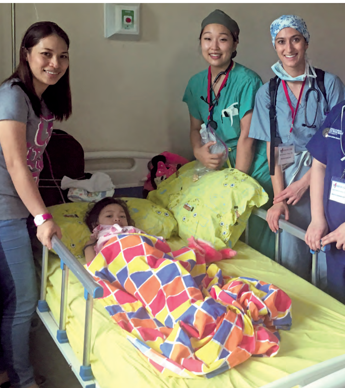
Anesthesiologist Assistant students share their skills with children in the Philippines.