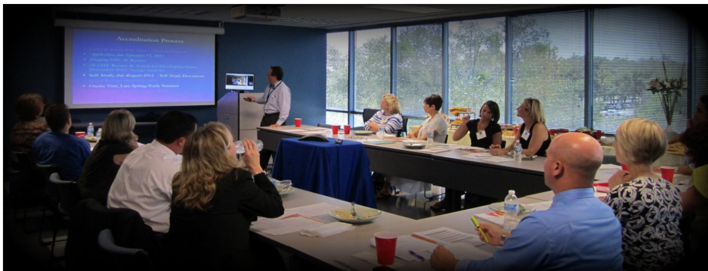
NSU Professional Advisory Council discusses the accreditation process.