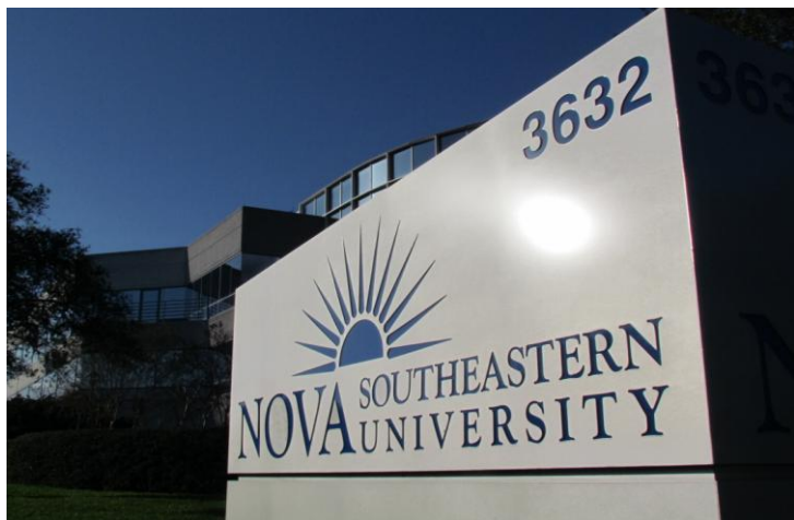
University signage on the corner of Falkenberg Road & Queen Palm Drive

During their Fall 2011 meeting, ACOTE, or the Accreditation Council for Occupational Therapy Education granted Developing Program Status to the hybrid entry level Doctor of Occupational Therapy (OTD) program at Nova Southeastern University Tampa. This is Step 2 of a 3-Step sequence of the accreditation process, and means that the Department can now start admitting students from the applications received through AOTA's Occupational Therapy Centralized Application System