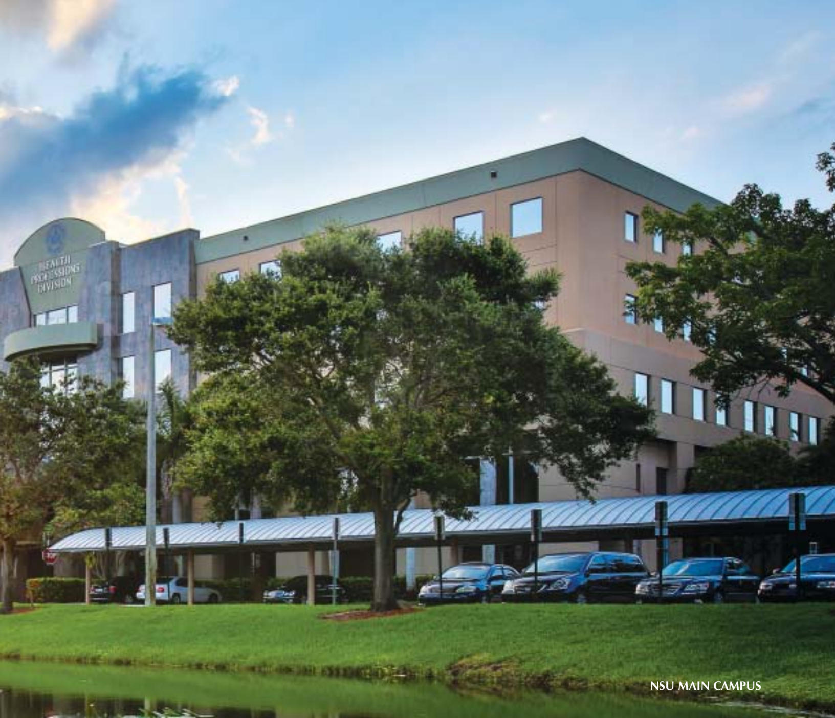
NSU MAIN CAMPUS

166,000 alumni and current enrollment of more than 24,000 students . Fully accredited by the Commission on Colleges of the Southern Association of Colleges and Schools, the university awards associate's, bachelor's, master's, educational specialist, and doctoral degrees in a wide range of fields including the health professions, law, business, marine sciences, psychology, social sciences, computer and information sciences, and education.